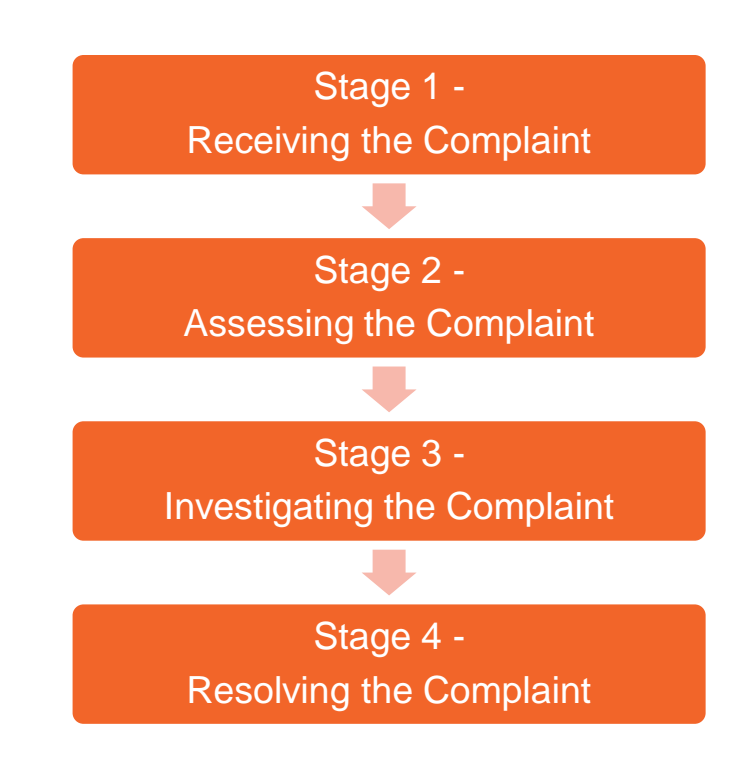
Figure 2.1: Overall Complaint Handling Process Flow Chart

As part of the EM&A requirements of the project, the overall environmental complaint handling process is shown in Figure 2.1 .